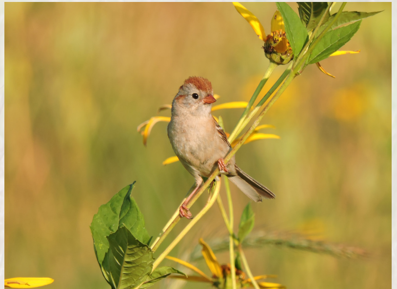
All photos by Dan Small and taken at various Natural Lands Project properties.