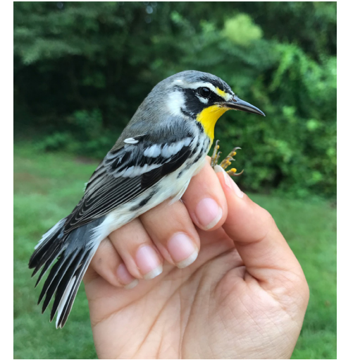
Left: Northern Shrike.