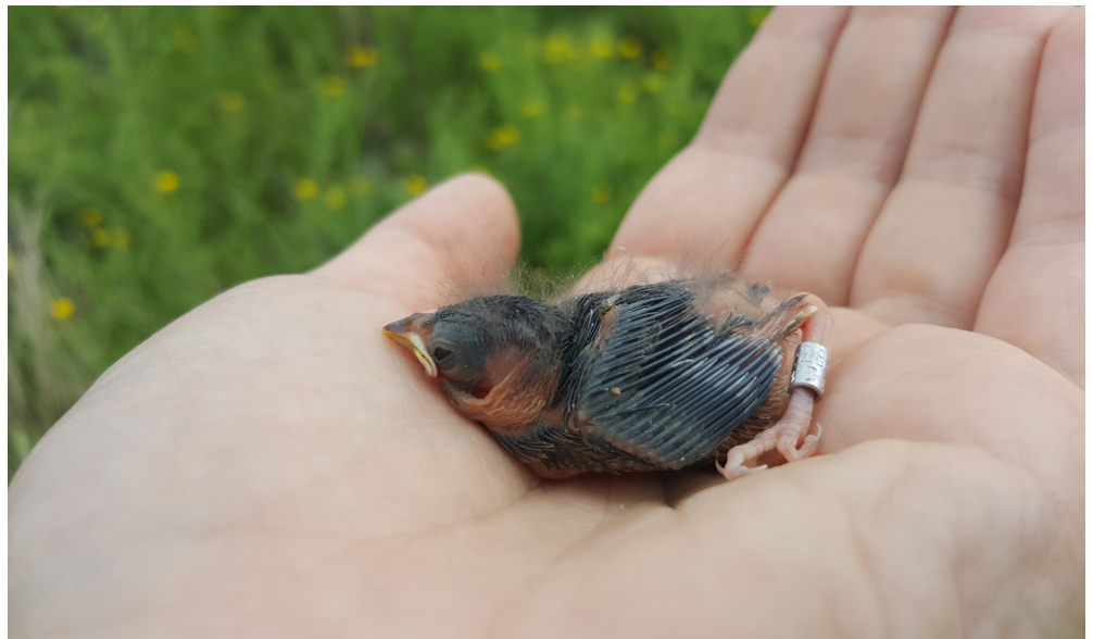
Cover photo: Indigo Bunting at a Natural Lands Project site. This page: Field Sparrow nestling, photo by J. Carr.

Regardless of the specific questions we are asking in a given year, the bulk of the field work on sparrows remains the same. We identified color banded birds that returned to breed on the site, color marked birds that are new to the site, mapped the territories these birds maintain over the course of the breeding