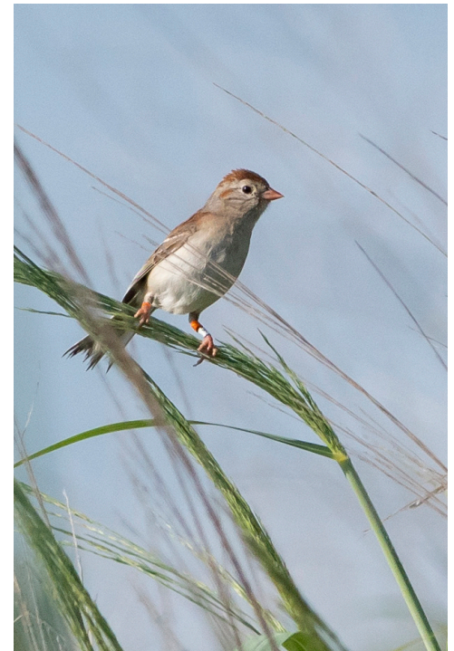
Top left: the 2019 grassland bird crew. Top right: interns observe sparrows. Bottom right: color banded Field Sparrow.

These experimental grasslands continue to be a source of great public interest, a sanctuary for wildlife and a living laboratory for students of all ages.