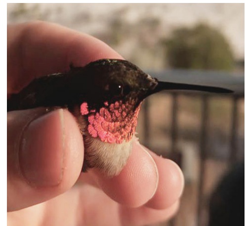
Ruby-throated Hummingbird in Gulf Shores, AL, photo by F. Chalk.

second year bird (meaning it hatched in 2013 or earlier). That banding date indicates that it was likely breeding at the Massachusetts site and was migrating south for the winter when we captured it in September. At the time we captured it at FBBO the bird was at least 6 years old. The last foreign recapture of the year was a Swamp Sparrow we captured on October 25th. #2811-07668 had been banded only 5 days earlier in Cape May, NJ 60 miles southeast of FBBO. Cape May is the closest major banding station to FBBO and this was the 7th bird we have captured that was banded there.