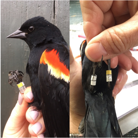
Male Red-winged Blackbird #1352-12494.