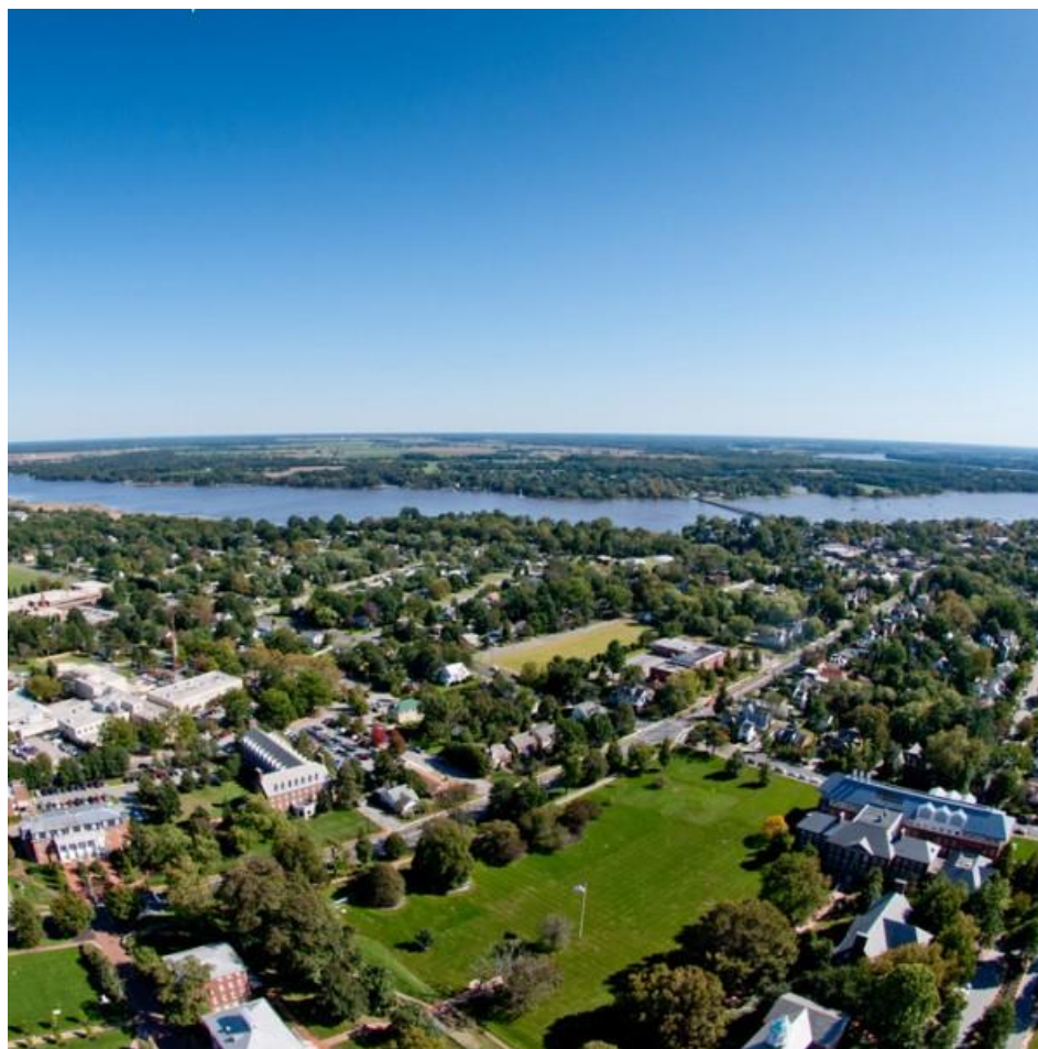
An aerial photo of Washington College and Chestertown

The handbook has basic information that will assist you as an incoming international student. Whether you are coming to the U.S. for the first time or know a great deal about U.S.-American culture, this handbook answers many questions previously posed by international students. We look forward to meeting you and once again, we extend our warmest greetings!